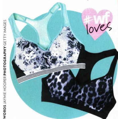
WORDS: JAYNIE HOOPER

Up the fun factor of your workout wardrobe (and keep everything in place during Body Attack) with the new range of Cotton On Body KIR sports bras. With underwire support and breathable mesh fabric, these cuties have all bases covered. $29.95, cottononbody.com